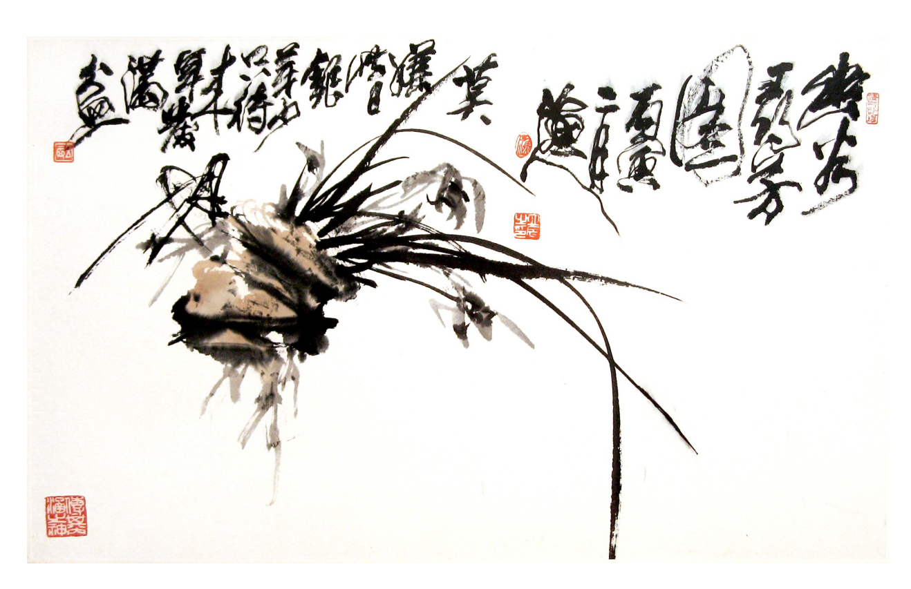
Zhang Lichen (b.1939) – Orchid, 1986, Ink and color on paper, 19.25 x 31.5 in, Signed with 5 artist seals