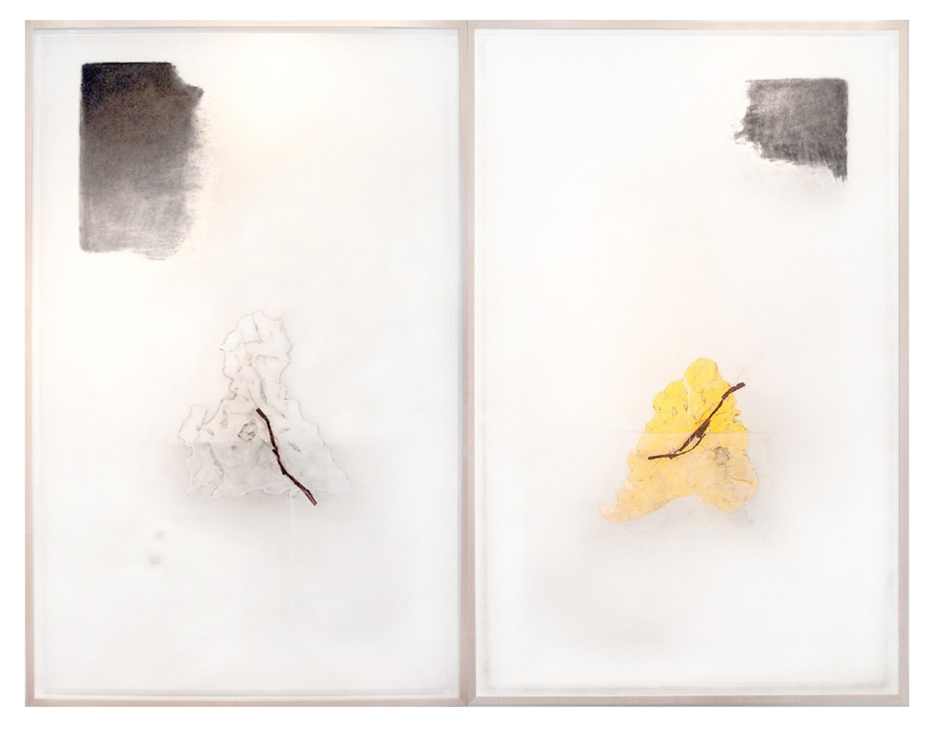
He Sai Bang (b.1959) - Golden and Silver Stone, 2006, Mixed media on paper, 61 x 39 inches each (A pair)