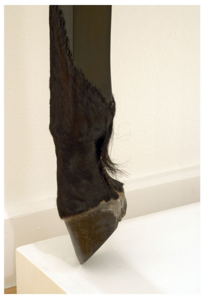
SCHOLAR'S NIGHTMARE 2001

A Ming-style table, as seen in a dream, where reality and abstraction converge.