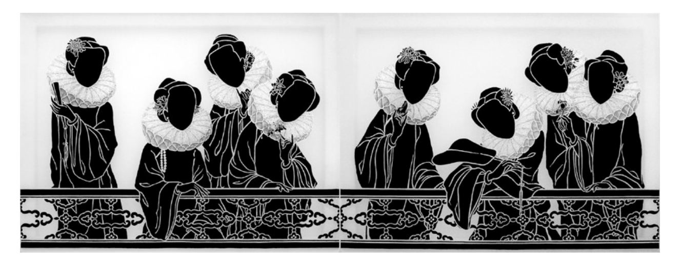
Annysa Ng - Ambiguous Space aka Hua Xuan, 2009, Ink on silk, Two panels: 30 \times 40 inches each, overall dimension 30 \times 80 in