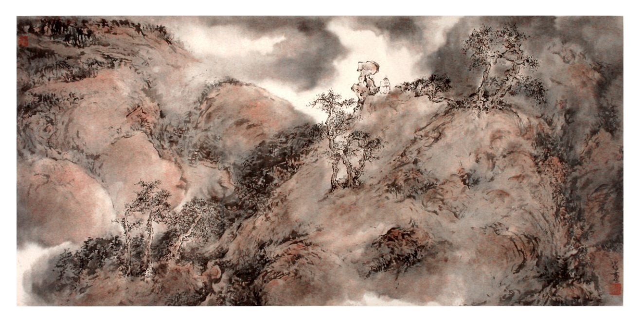
Zeng Xiaojun (b.1954) - Mountains and Rocks as Companions, Ink and color on paper, 25 x 52.25 in