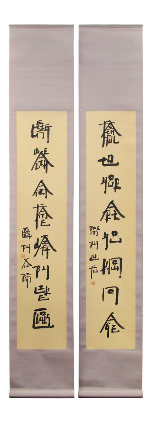
Xu Bing (b.1955) - Square Word Calligraphy Couplet - Poem by Du Fu, 2010, Hanging scroll, ink on paper, Image: each 51 x 10.875 inches, Scroll: each 81 x 14.125 in