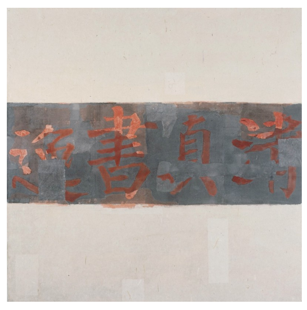
Wei Jia (b.1957) - NO.0660 Yan Zhenqing, 2006, Mixed media, 52 X 52 in