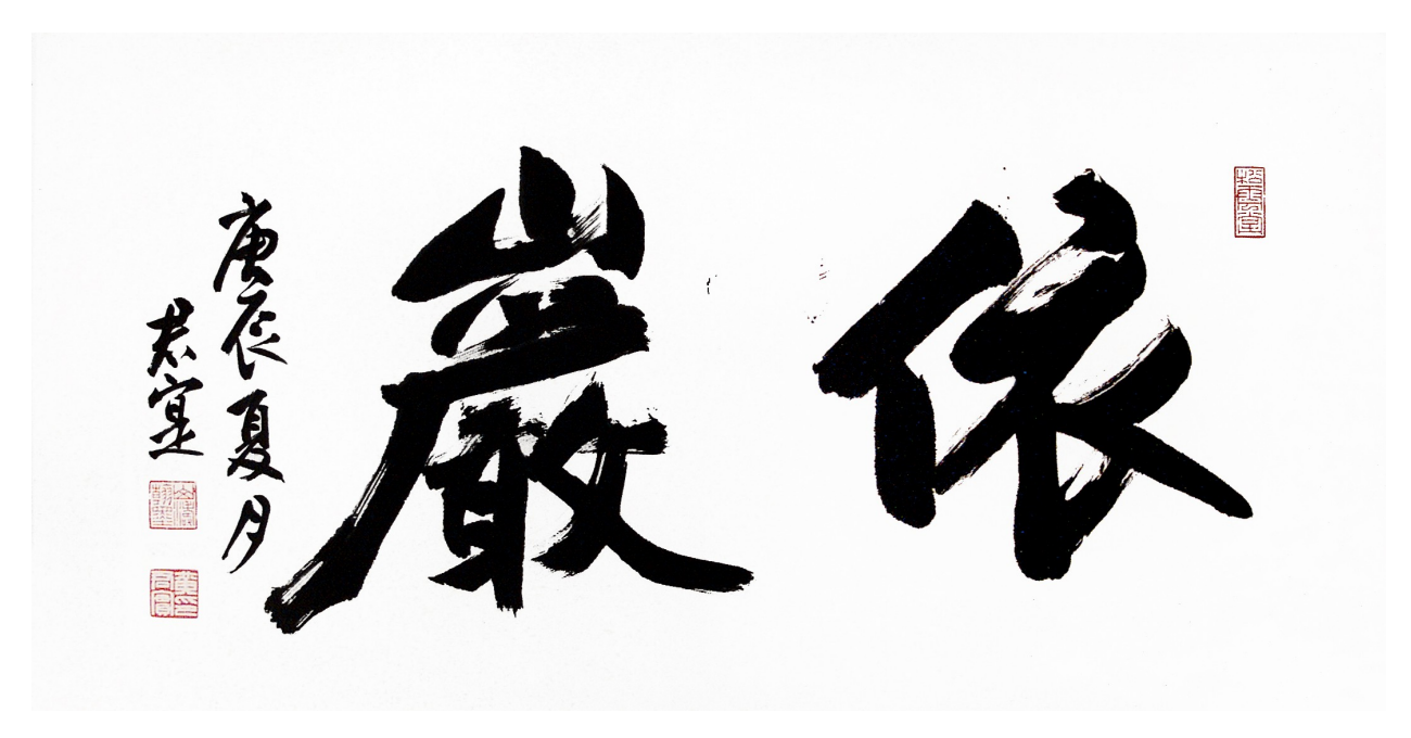
K.S. Wong (b.1934) - Calligraphy, 2000, Ink on paper, 37 x 67 in, Signed with three seals.